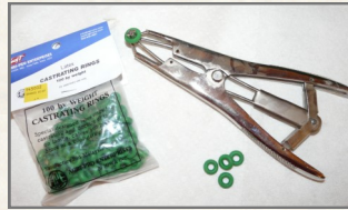
Ring expander and rings

in the body cavity, creating a "short scrotum". These rams produce testosterone but generally are not fertile—all of the hassle, with none of the benefits.