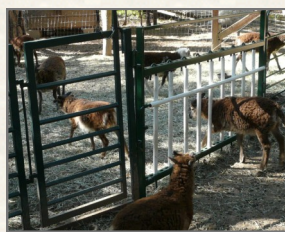
Shaul's creep panel