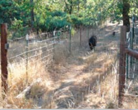
Ella and assistant at the back fence

for the former and now she is over the gate and into any pen whenever she perceives there is a problem.